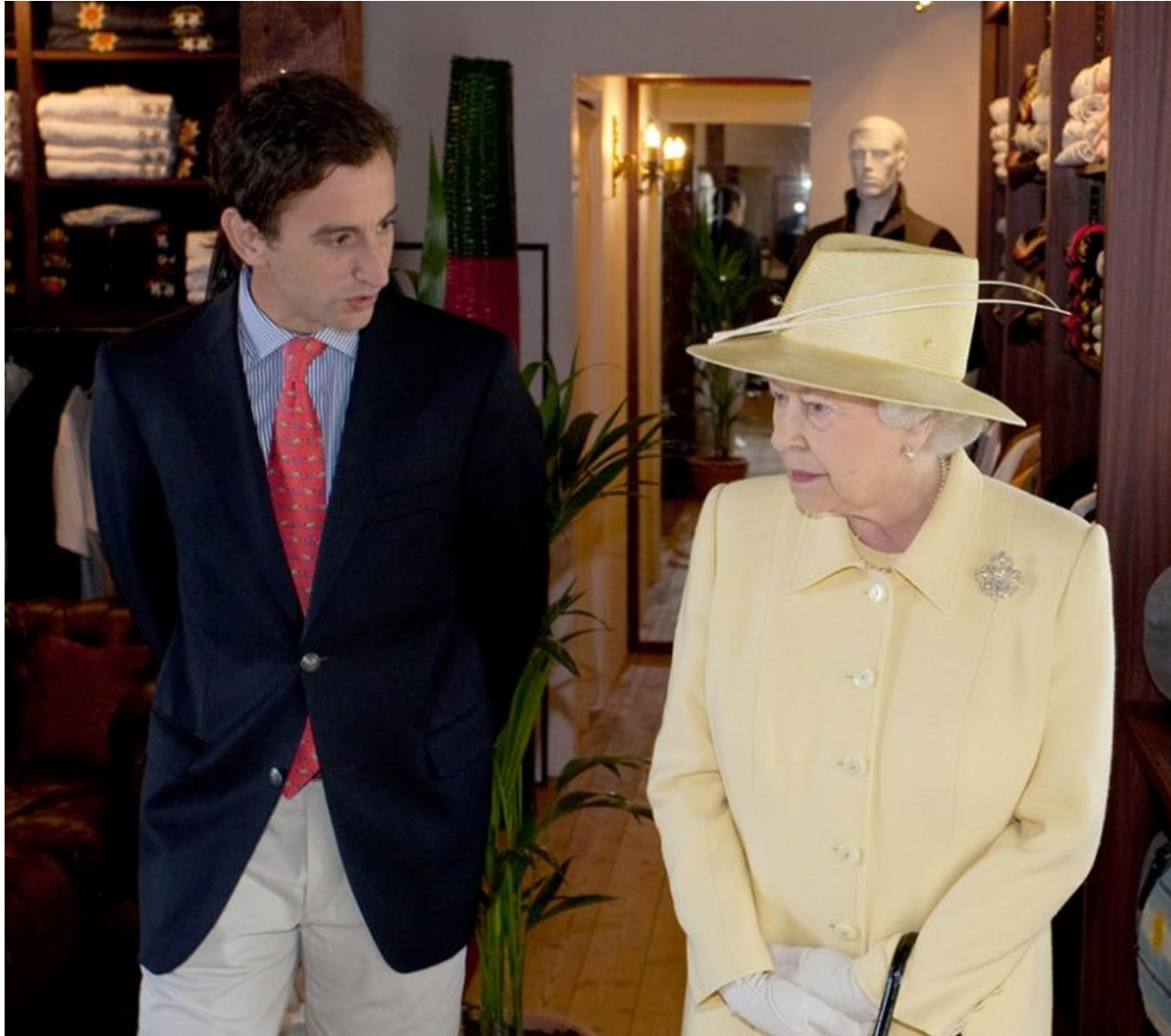
ADRIÁN SIMONETTI & THE QUEEN OF ENGLAND