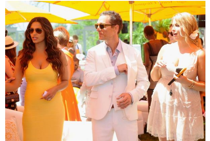
Above: Matthew McConaughey + Camila Alves