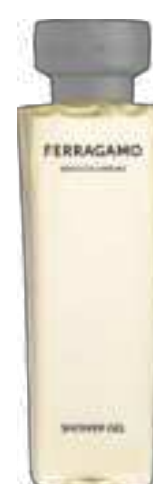
85 ml (Production with MOQ) JFE58046