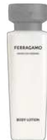
50 ml JFE58043