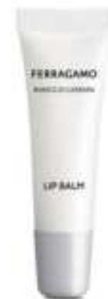
Lip Balm 10 ml JFE58062