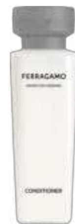
50 ml JFE58044