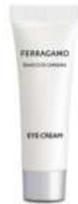
Eye Cream 10 ml JFE58036