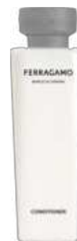
85 ml (Production with MOQ) JFE58093