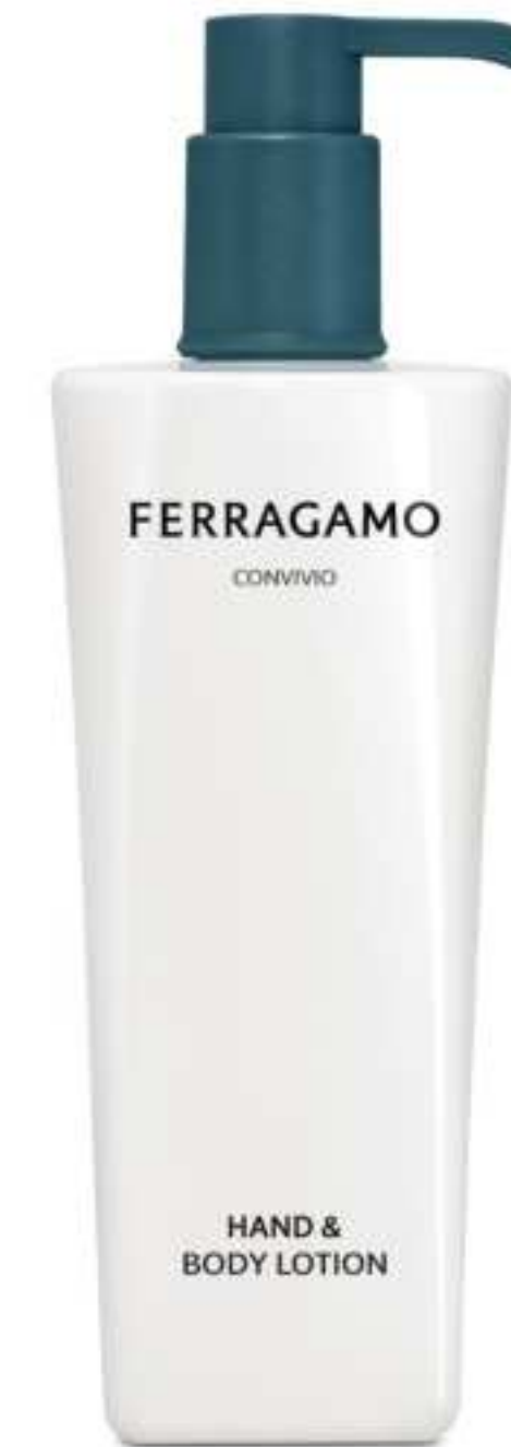
Hand & Body Lotion