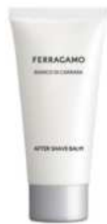
After Shave Balm 30 ml JFE58064