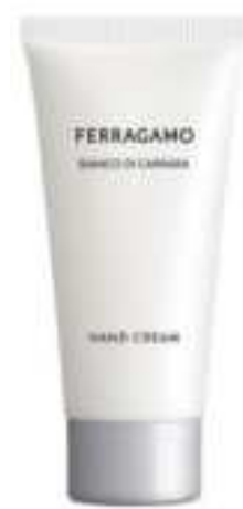
Hand Cream 30 ml JFE58035