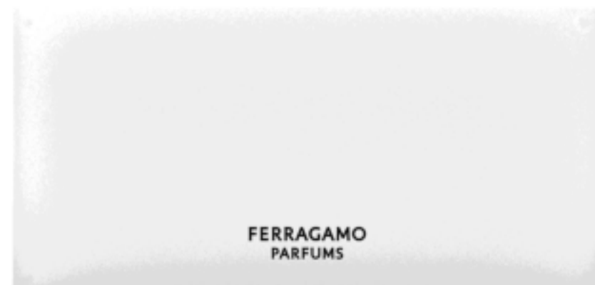
Tray 25x12 cm JFE58890