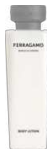
85 ml (Production with MOQ) JFE58092