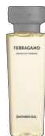
50 ml JFE58042