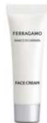
Face Cream 10 ml JFE58063